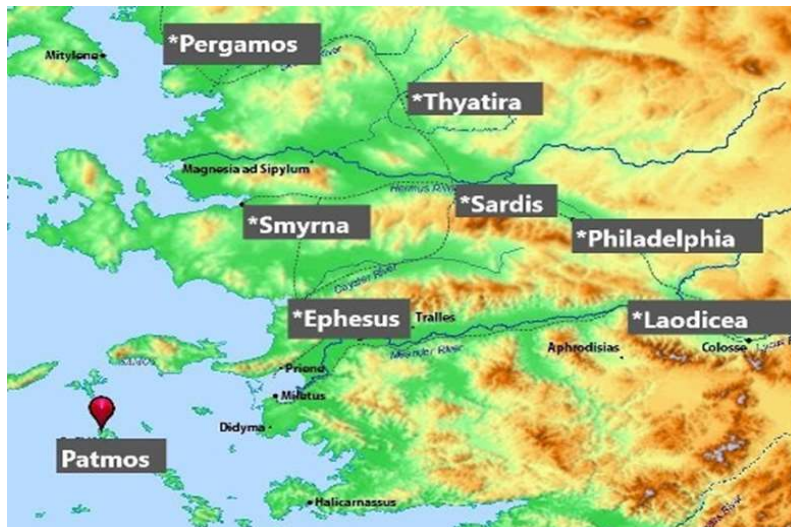
Seven Churches Map